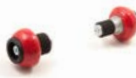
Variante 2: Mit Klemm-Gummis verschraubt