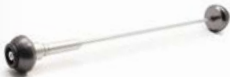
Variante 1: Durch die Achse verschraubt

Je nach Motorradmodell werden unterschiedliche Montagevarianten eingesetzt. Mit Stange verschraubt oder mit Gummis geklemmt.